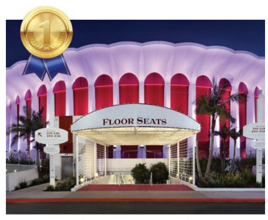
Kia Forum - Inglewood, CA