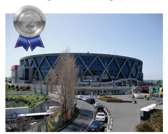
Oakland Arena - Oakland, CA